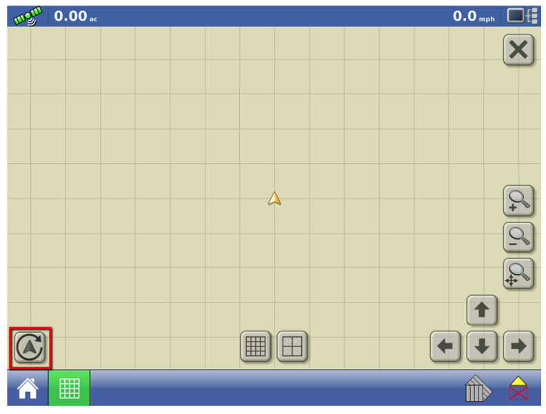
Figure 2 - Press center of map screen and heading change button will appear

When Heading Detection is disabled, the GPS heading will always be considered as forward.